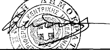
D. Psemmadis Dionysios Psemmadis The Deputy Governor of the Region of Central Macedonia